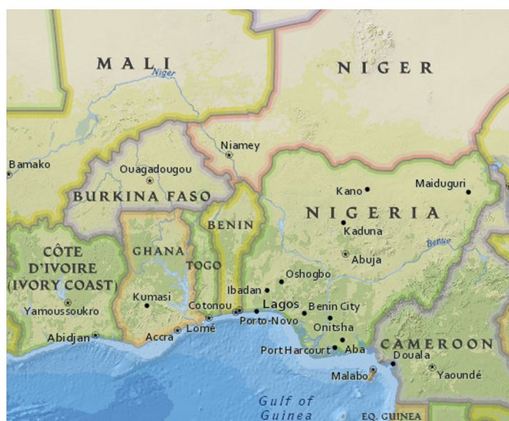
Figure 1 – Map of Benin and its neighbours.

The case of Benin is particularly relevant for this issue. A small, poor country, it is a member of WAEMU 3 , a monetary and customs union of eight countries in West Africa. It shares land borders with three WAEMU members, Togo, Burkina-Faso and Niger (see figure1). This union has progressively dismantled internal tariffs and put in place a common external tariff. Benin's fourth border is with Nigeria, the second-largest economy of the continent. Nigeria and Benin also share membership in a regional agreement, the ECOWAS 4 , larger than WAEMU but less advanced in terms of trade liberalization. As of 2011, the ECOWAS had not dismantled internal tariffs. Nigeria has a protectionist trade policy with high peaks, non-tariff barriers and import bans; its currency is non convertible and chronically overvalued (IMF, 2017). Thus, Benin's borders offer a case study of trade liberalization efforts at different stages, and gives us the opportunity to examine their impact on the informality of trade. We focus on trade at Benin's two main land borders, with Togo and Nigeria; and consider regional trade , i.e. exports and imports at these two borders. 5